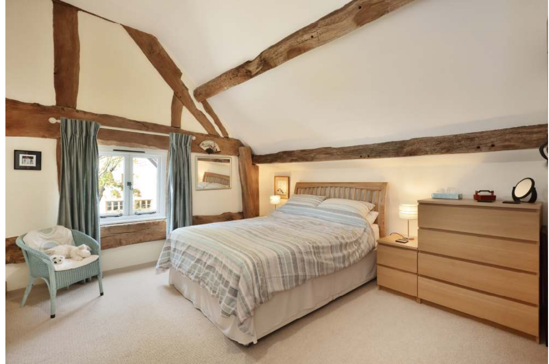
Three of five bedrooms with supporting family bathroom